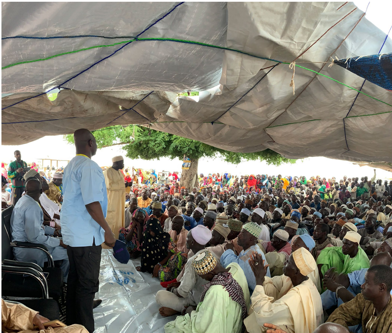
As part of a Global Center program to promote community-driven governance, senior government officials meet with people internally displaced by Boko Haram in Kolofata, Cameroon, 2019.

There is no universal solution to violent extremism. What works in one place may be ineffective at best in another. That is why the Global Center's work is highly tailored to the specific drivers and circumstances in the communities, countries, and regions in which we work.