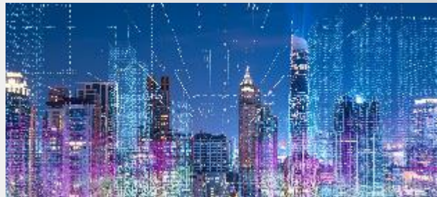
Protecting business assets