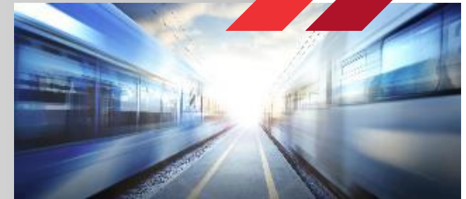
Union/work council relations