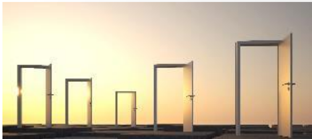
Recruitment and reward