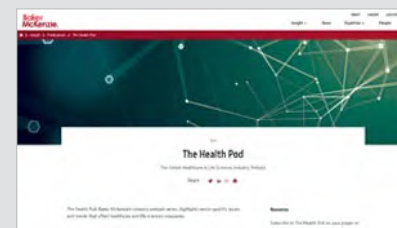
The Health Pod

Disclaimer: This global survey provides a general overview of cannabis regulation in various countries of the world and should not be relied on as confirmation of the legality of any specific activity in any particular country. Anyone considering engaging in any cannabis related activity should always first consult qualified local legal counsel to obtain guidance related to the particular activity contemplated.