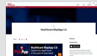
Our Healthcare MapApp